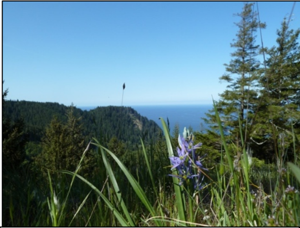
The Rare Coyote Camas on Yachats Ridge