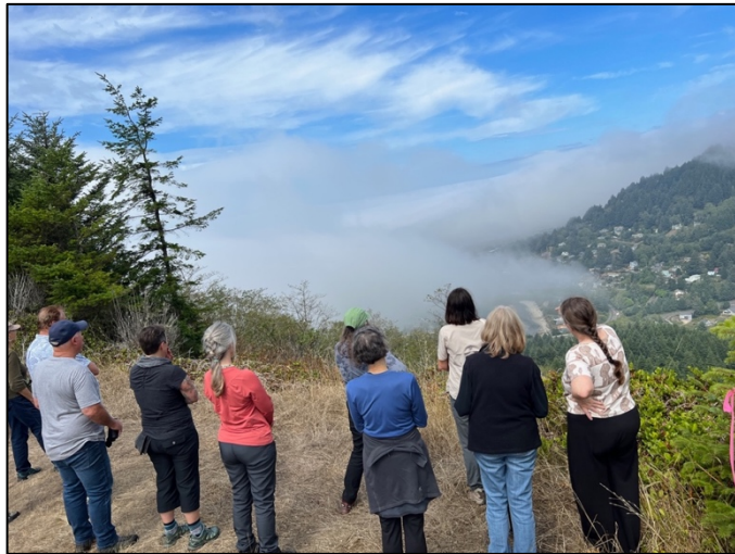
Participants in one of the Yachats Ridge tours look out on the City of Yachats