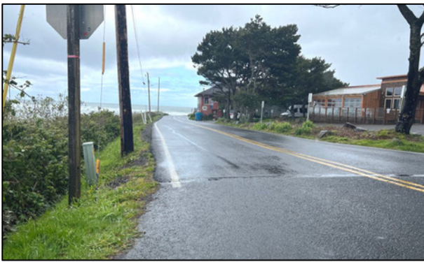
Ocean View Drive Walkway Project, Current View