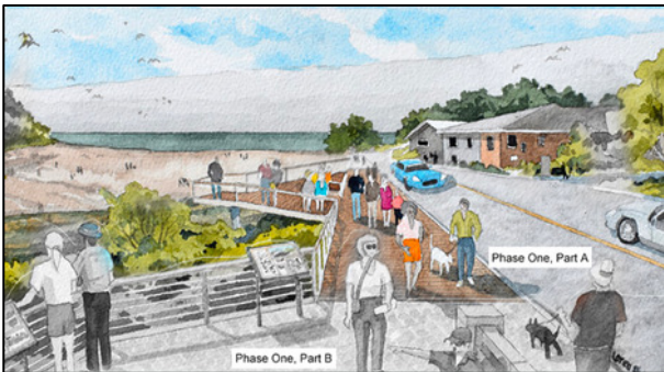
Ocean View Drive Walkway Project, Concept Drawing