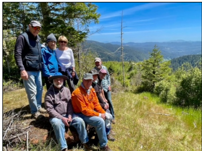
Sitting on the Cow Pie Lava Bomb in the East Meadow of Yachats Ridge