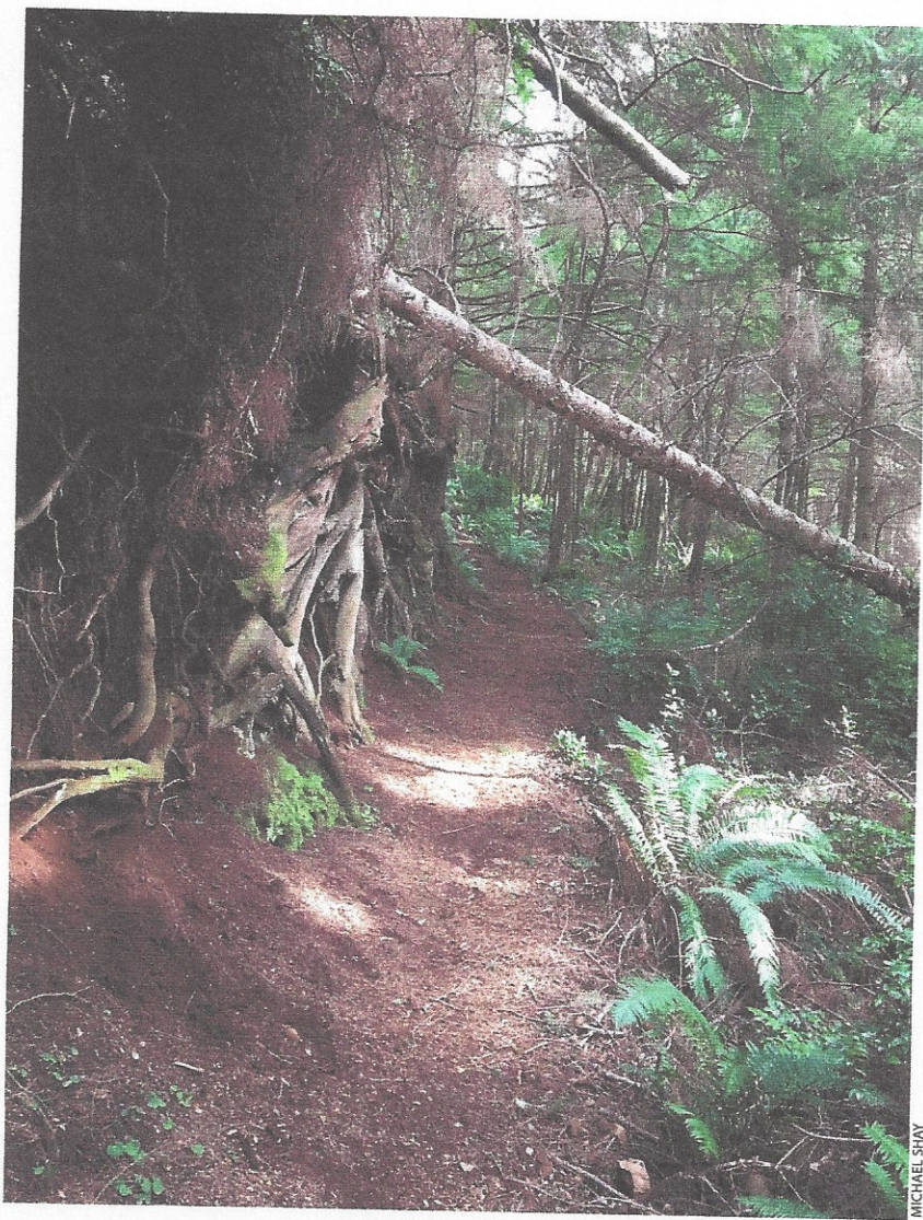
Scene along Amanda's Trail from Cape Perpetua to Yachats.

allowed hunting and encouraged the Indians to build a road into the Yachats valley, where they grew additional crops. Their success attracted white settlers' attention.