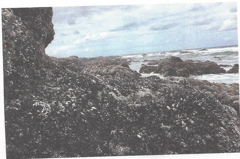
BELOW: Indians from Alsea Bay harvested shellfish from the rocks below the 804 Trail at low tide.