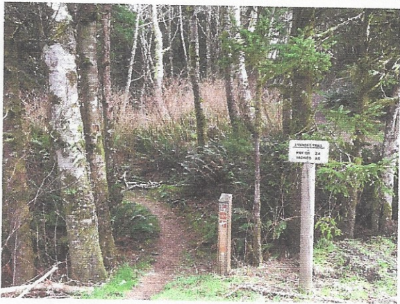
CLOCKWISE FROM TOP: Volunteers salvaged a piece of the washed out bridge to use until a replacement is built; Yachats from Amanda's Trail; Amanda's Trail begins at the top of Cape Perpetua and ends in Yachats; Paths like the Ya'Xaik Trail serve as a vehicle for remembering those who came before us in Yachats.

“to show our ancestors that we care, acknowledge them, and are doing what we can to honor them.”