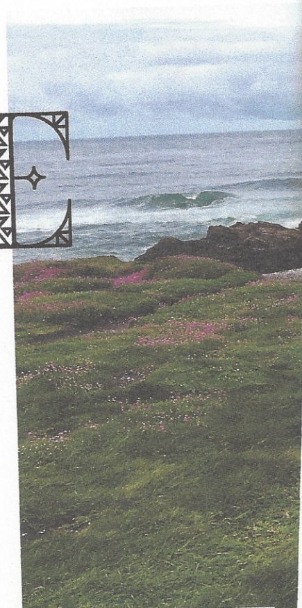
ABOVE: The layer of white shells in the middle of this photo is the partial footprint of a midden that once towered forty feet above the bluff behind the Adobe Resort.

We know Indians from Alsea Bay camped here in summer and fall. They left middens, piles of shells, and other materials along the basalt bluffs of the 804 Trail. As I walk the 804 each morning with my furry friend, Turbo, I often stop at the footprint of a midden